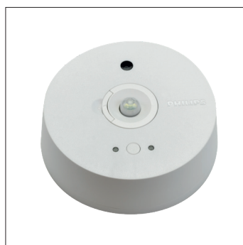
MCS wireless daylight&occ sensor