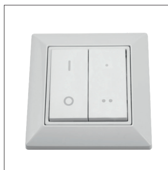
XCS wireless switch